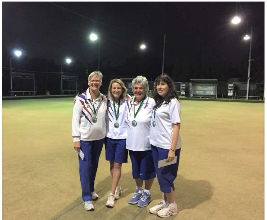
Yarra Region Women's Fours Champions Winners 2019-2020