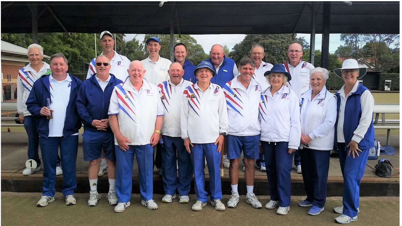
on the Sunday of the GF