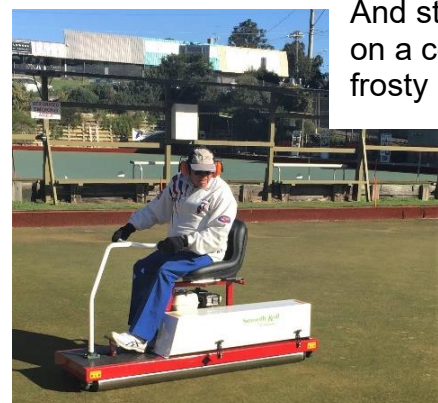
And still rolling on a cold and frosty morning.