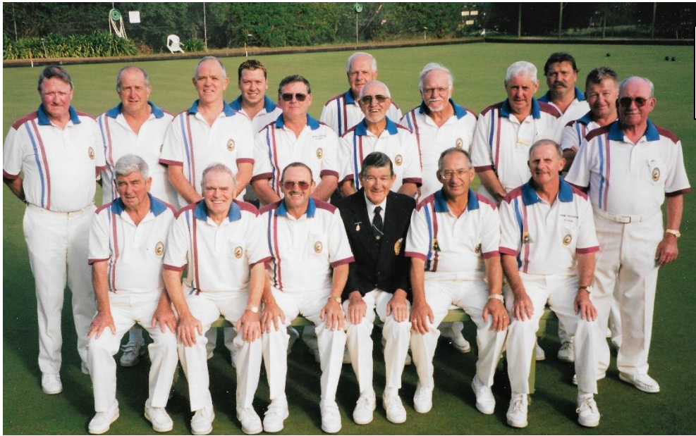
March 2002 Pennant Winners 01/02 Saturday Div 3