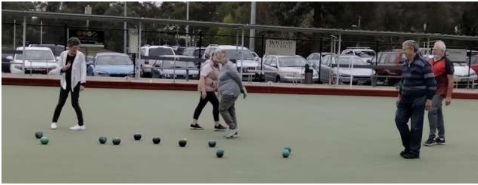
A head inspection on an end change over.