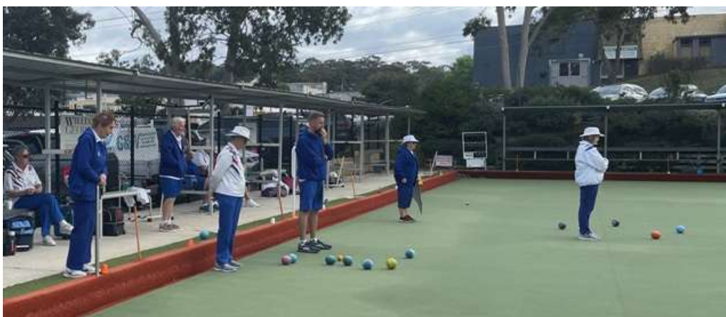
Some action pictures during the single day event.