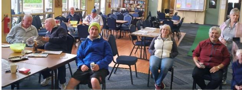
Race time, all (almost) eyes on the TV.