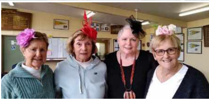
Clubhouse Fascinator show time, and the winner is.....