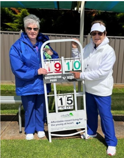
Some Vic Open pictures