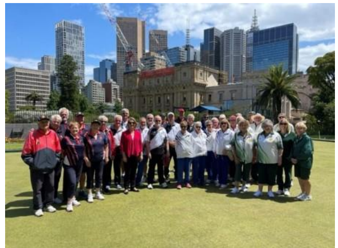
Obviously well looked after by the hosts!