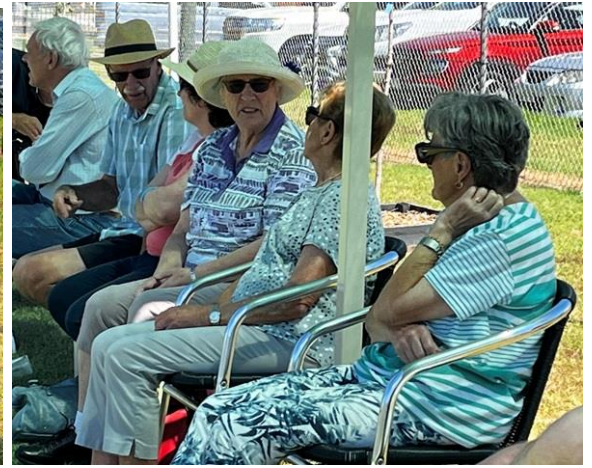
Some of the extras - the side was well supported for the game, thanks to all who came along.